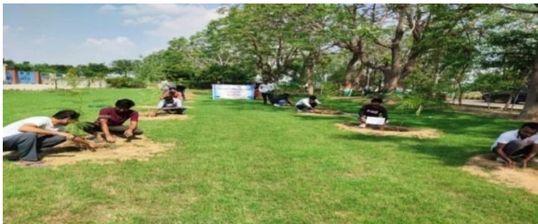
Plantation Drive in the Campus

Indira Gandhi University, Meerpur has started a drive to make the campus green and with this objective, plants of different varieties are planted every year. More than 5000 plants of fruits, herbal and medicinal value etc. are being planted on regular basis.