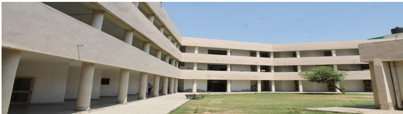
Rani Laxmi Bai Girls Hostel

The university has one Boys Hostel viz. Maharana Pratap Boys Hostel and one Girls Hostel viz Rani Laxmi Bai Girls Hostel. The students may apply for the hostel separately and the Information Brochure for the same is available on the university website www.igu.ac.in .