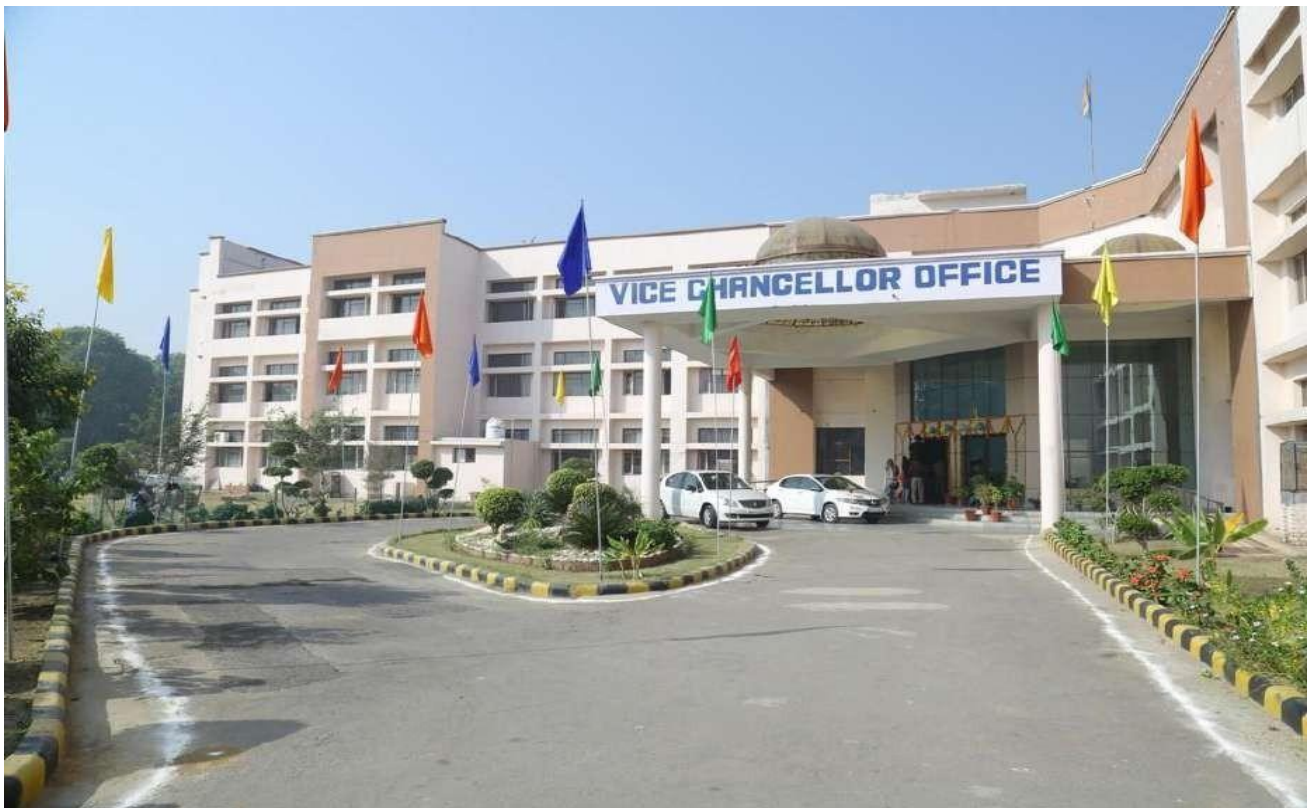
Panoramic view of the Campus

The university is committed to work vigorously for the all-around personality development of students by making them not just outstanding professionals and entrepreneurs but also good individuals with ingrained human values. The university campus is situated in village Meerpur at a distance of 10 km from the district headquarters of Rewari, about 340 km from Chandigarh, the State Capital and 70 km from Indira Gandhi International Airport, New Delhi. It is well connected by railways and roadways as well.